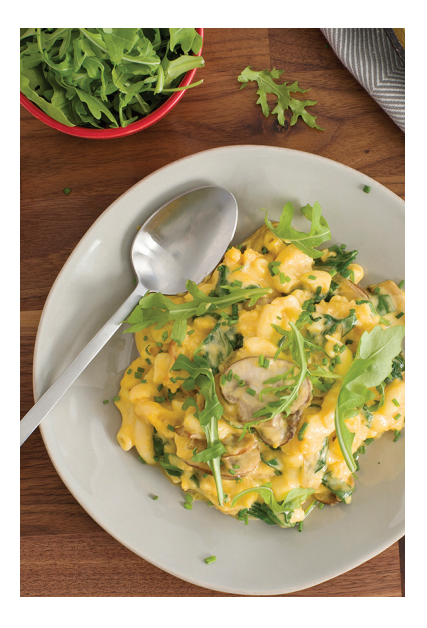
Mushroom Mac & Cheese A mix of sautéed mushrooms adds a meaty texture and earthy flavour to this vegetarian Mac & Cheese.