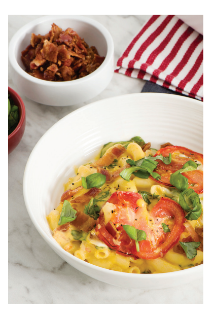
Bacon Mac & Cheese The addition of bacon, arugula and tomato makes this BLT Mac & Cheese a sure hit with any age group.