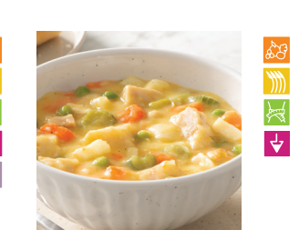
Hearty Chicken 08765 and Vegetables A savoury blend of chicken, potatoes, carrots and peas.