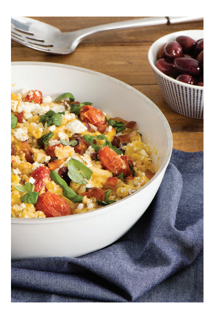
Mediterranean Mac & Cheese Sweet roasted tomatoes, rich Kalamata olives and zesty feta cheese create a warm and inviting version of Mac & Cheese.

Campbell's Food Service portfolio of Macaroni & Cheese products are perfect on their own, or as a great base to customize and create multiple menu offerings.