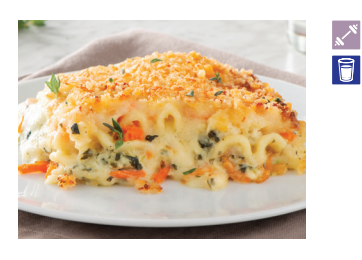
Garden Vegetable Lasagna 08063 Lasagna noodles and garden vegetables layered between a blend of mozzarella, ricotta, Cheddar and Parmesan cheeses and finished with a golden breadcrumb crust.

lasagna collection made with fresh pasta